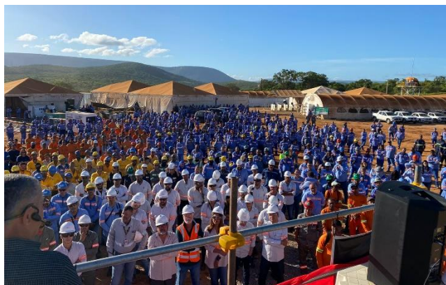
Figure 17: Homecoming Employment Program