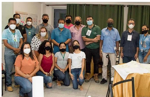
Figure 18: Education Program for Mining Technicians