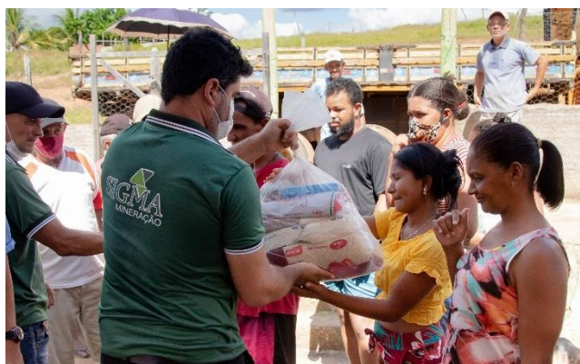
Figure 19: Zero Hunger Action