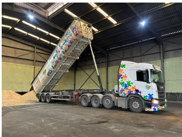
Figure 21: Green Tailings Warehoused at Port