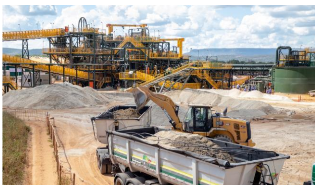
Figure 5: Truck Loading for Delivery to the Port