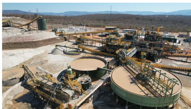
Figure 4: DMS Circuit