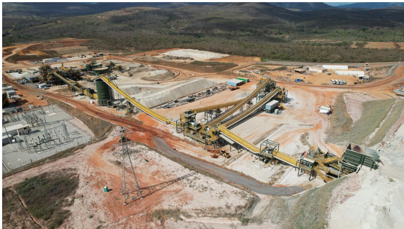
Figure 2: Sigma's Corporate Targets of Creating Value in a Sustainable Way