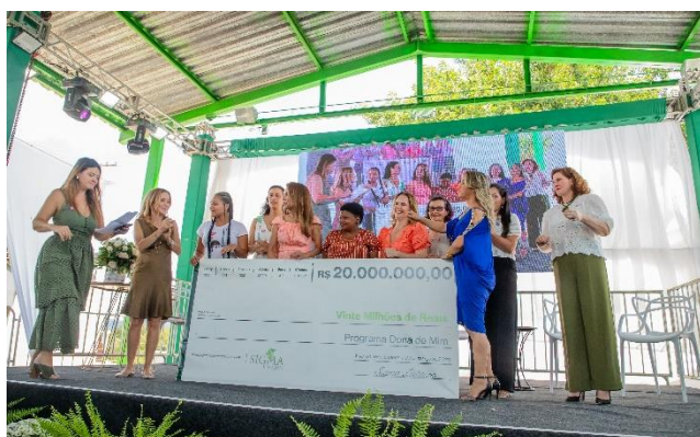
Figure 15: Microcredit Program Expansion Event