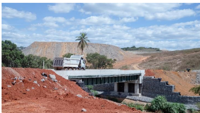
Figure 11: Piaui Bridge