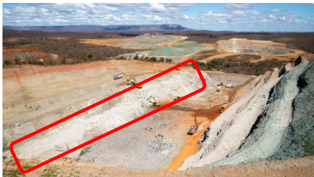
Figure 9: North Pit Mining