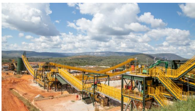
Figure 3: Crushing Circuit