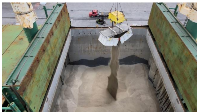
Figure 7: Loading First Shipment of Green Lithium