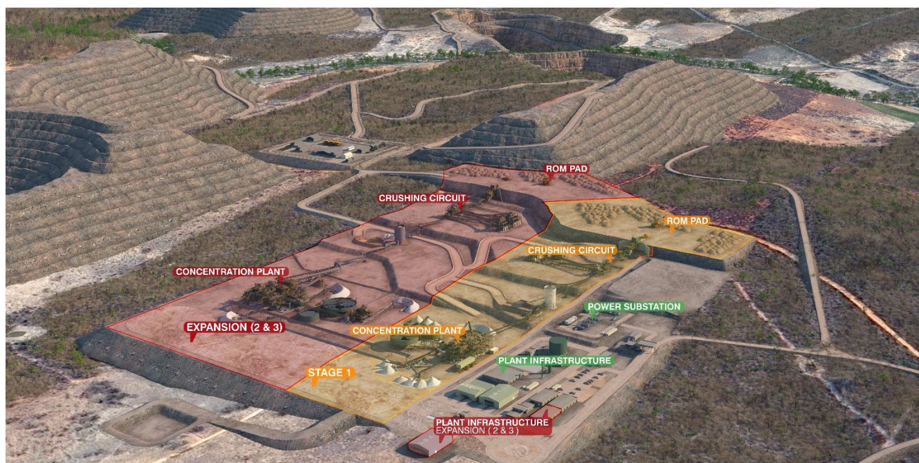
Figure 14: Planned Expansion of Phase 2 and 3